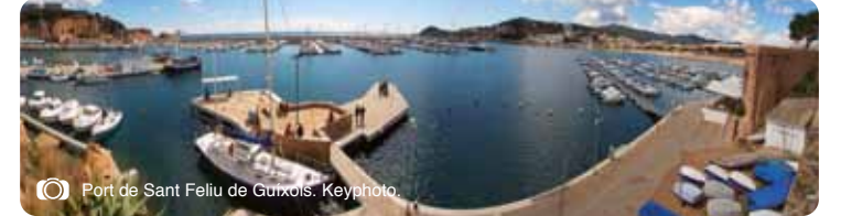
Port de Sant Feliu de Guíxols.

The port itself caters for leisure, merchant and fishing vessels, it is the connecting point between the town and its seafaring origins, the result of a close link with the Mediterranean, which has lasted until today. A stroll to the lighthouse on the pier reveals the link between the town of Sant Feliu de Guíxols and the sea.