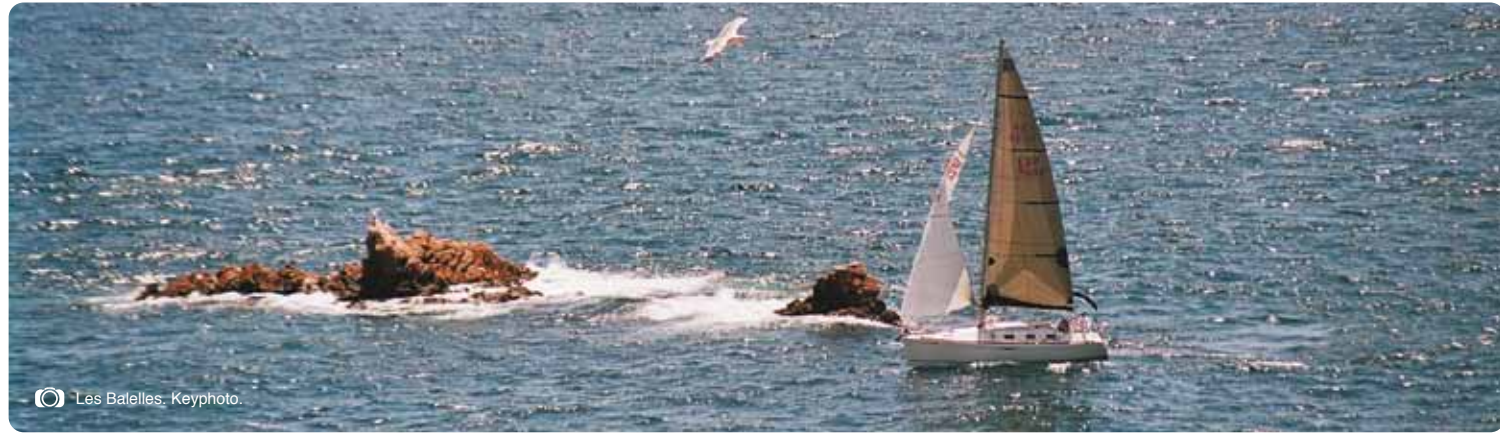
Les Bafelles. Keyphoto.