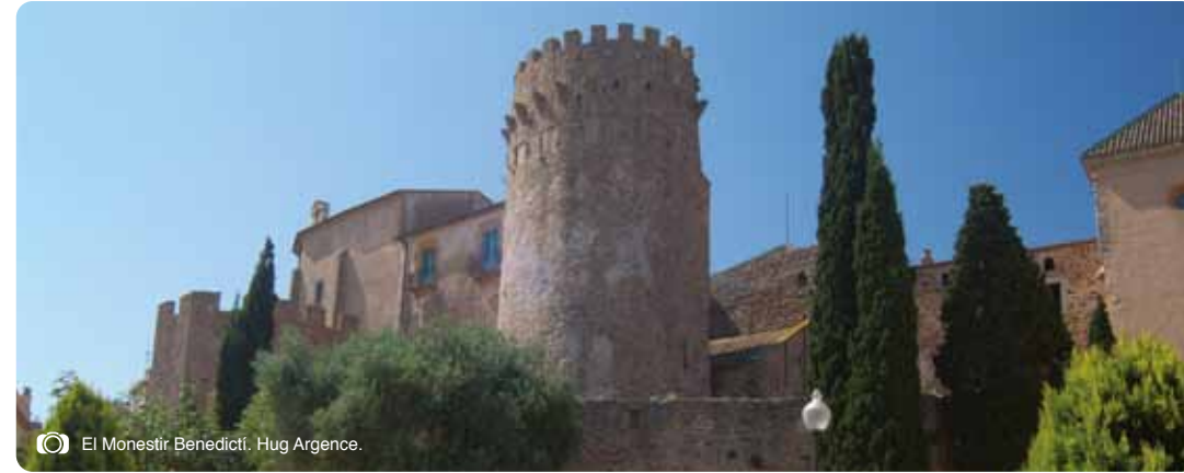
El Monestir Benedictí. Hug Argence.