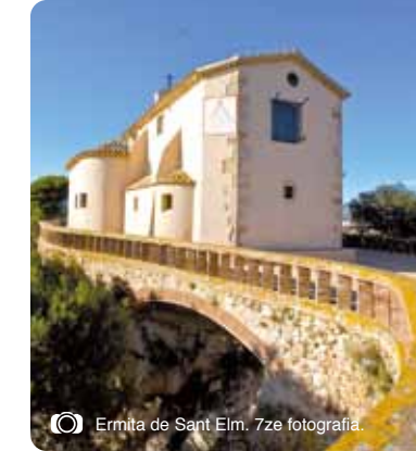
Ermita de Sant Elm. 7ze fotografia.