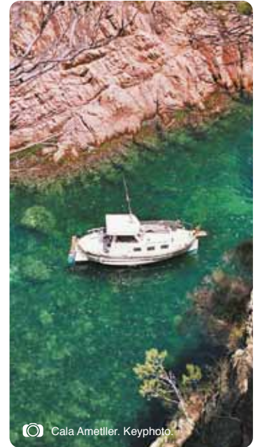
Cala Ametller.